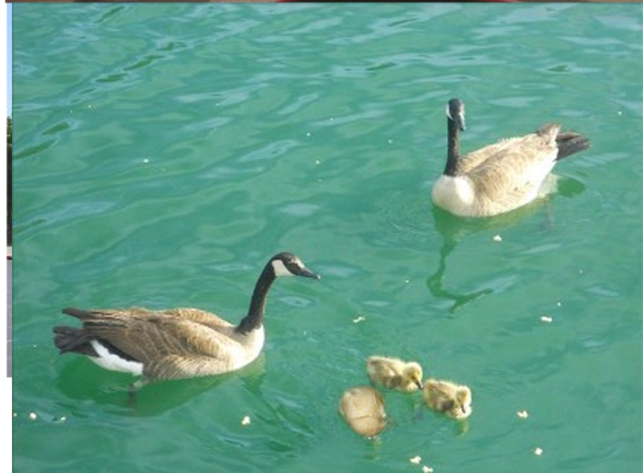
"Don't mind that old thing, honey, it does that all the time."